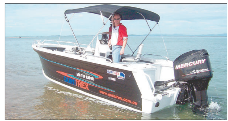
Quintrex and Mercury combine for an effective boating package

The 5.90 Top Ender is a serious fishing boat and the rear lounge set up adds a touch of comfort that's sure to please buyers wanting to impress the better half or stop the young ones whinging when having a day out on the water. It's size will dominate local rivers however islands and parts of the reef will sit comfortably within range. By design it's a fishing rig but subtle touches will make any on water activity pleasurable with the new 5.90.