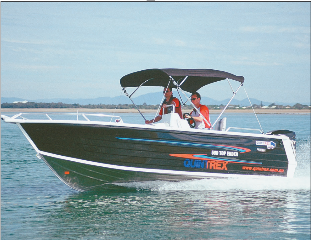
Jim and Steve enjoy the 5.90 on the Pioneer River.

in the past when a hurried cast from the bow of other boats has seen the lure accidentally catch the leading edge of the canopy! At the other end of the boat the canopy is far enough back to lean into the rod during a heavy strike without smashing your graphite stick into the aluminium frame.